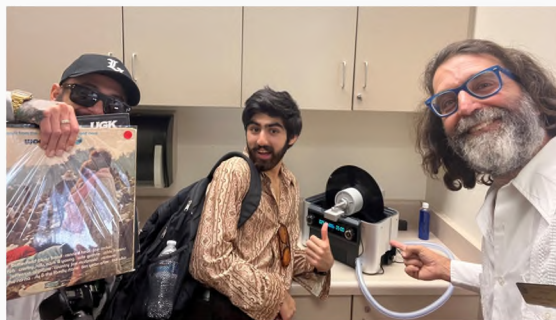
Midday Music vinyl listening and sharing session.