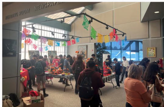
Dia de los Muertos student displays