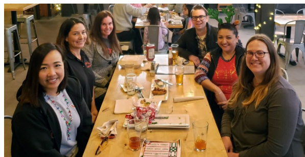
The IE team at Rincon Brewery